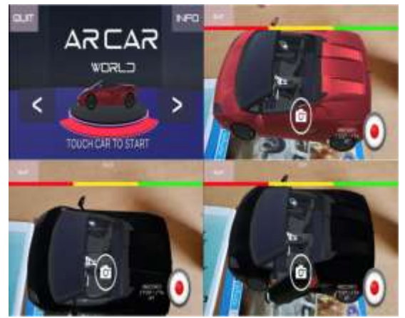
Fig. 3.Apk file